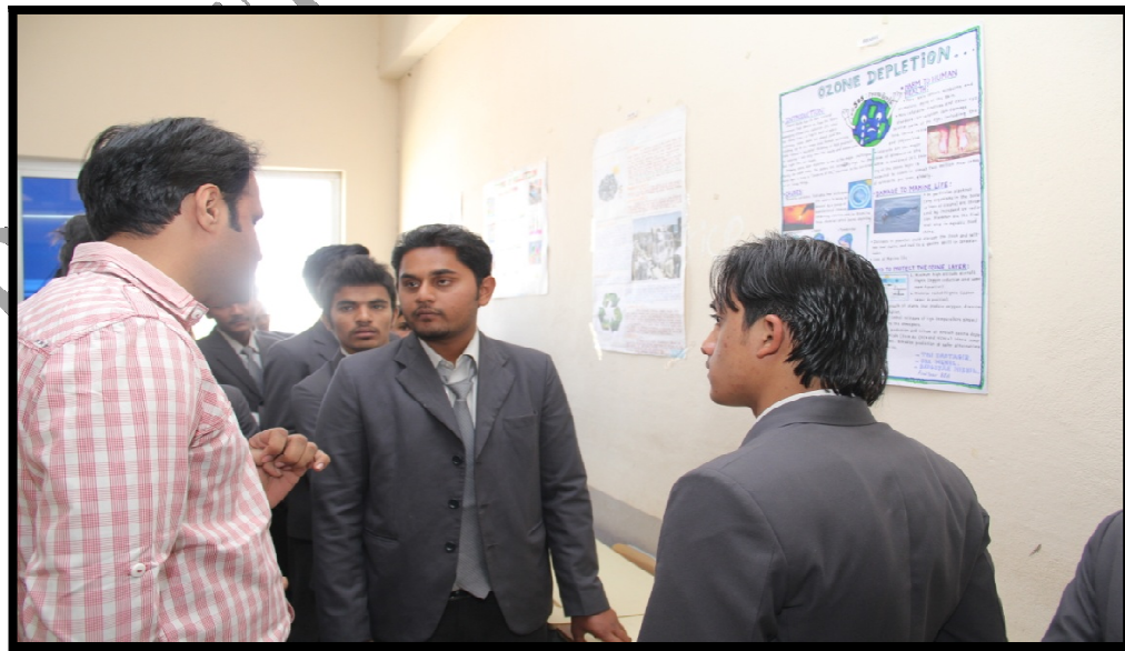
Student presenting poster at Institute Level Avishkar