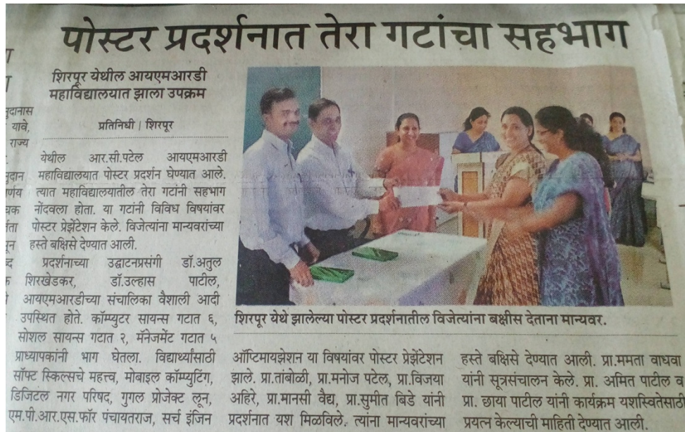
News Paper Cutting –Research poster competition news dated 24 th ,2016.